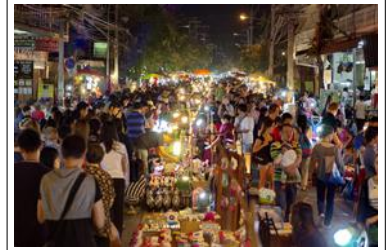
Chiang Mai Night Market