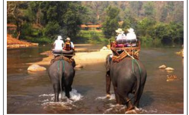
Chiang Mai Elephant Camp