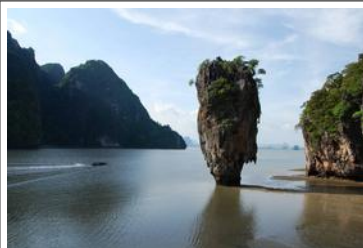
Phang Nga Bay James Bond Island

Excursion to Phang Nga Bay and its beaches, lagoons and limestone peaks : James Bond Island, Phi Phi Lee, Maya Bay (the movie "The Beach"), Koh Panyi Floating village, etc... Overnight in Phuket