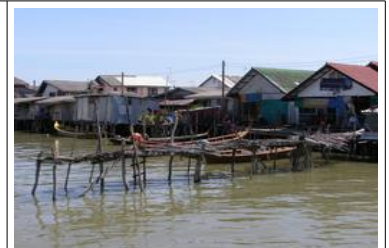
Koh Panyi Floating village