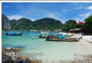
Koh Phi Phi

Day in Koh Phi Phi Baggage at the hotel Night VIP Bus from Phuket to Bangkok Overnight on the bus (duration : 11 to 12 hours approx.)