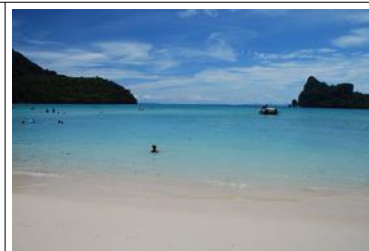
Koh Phi Phi