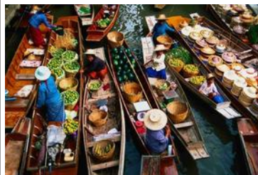
Damnoen Floating Market

Floating market : Damnoen Saduak Market (tourist and busy) or Amphawa (smaller but more true) Maklong Railway Market : a train in the heart of a market Visit in Bangkok : Grand Palace – Emerald Buddha Temple Overnight in Bangkok