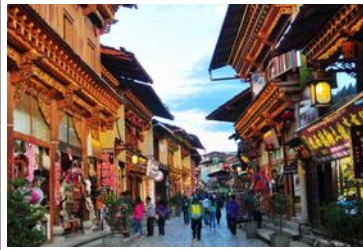
Chiang Mai Old Town

Early departure by bus from Sukhothai to Chiang Mai (duration : approx 6:00) Installation at the selected hotel in Chiang Mai Visit Chiang Mai Overnight in Chiang Mai