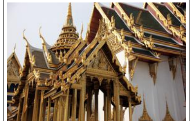
Bangkok Grand Palace