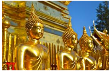
Chiang Mai Doi Suthep

Visit the Doi Suthep Temple Visit an elephant camp, elephant ride : day or half day to interact with elephants : feeding, bathing, riding, etc. Overnight in Chiang Mai